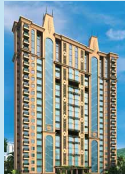
Hersh Aangan | Chembur