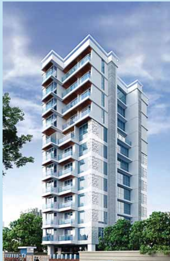
Samruddhi | Chembur