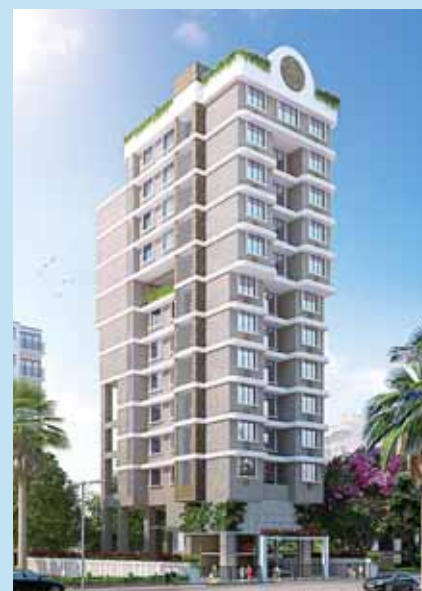
Aarambh | Mulund