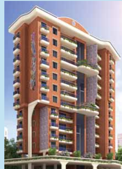
Rudraksh | Chembur