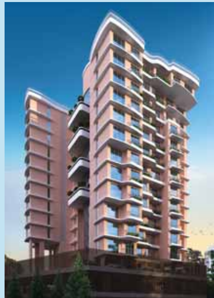
Tridhaatu Antariksh | Chembur