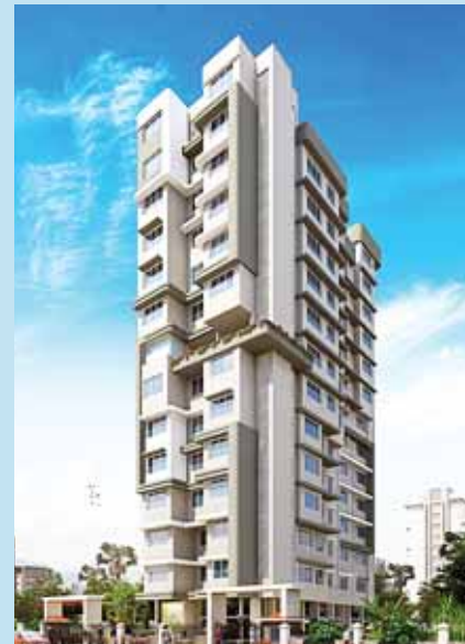
Tridhaatu Aayu | Chembur