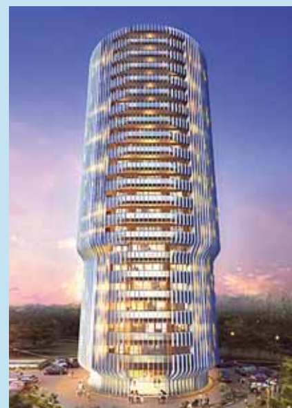
Aranya | Chembur