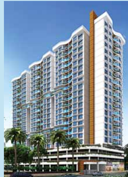
Tridhaatu Aum | Govandi