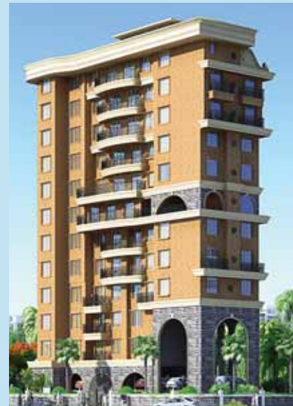
Aumkaar | Chembur