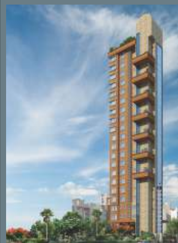
VIHAAN — MATUNGA —