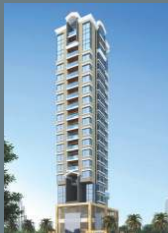
ATHENA — MATUNGA —