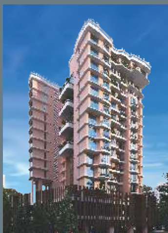
ANTARIKSH — CHEMBUR —