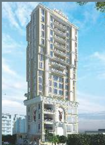
ARISTA — MATUNGA —