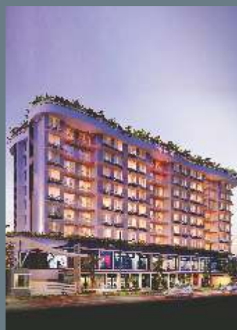
SANSKAR — GHATKOPAR —