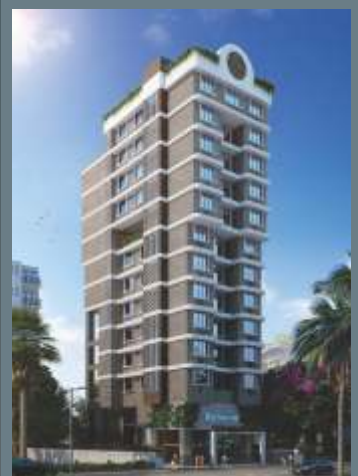
AARAMBH — MULUND —