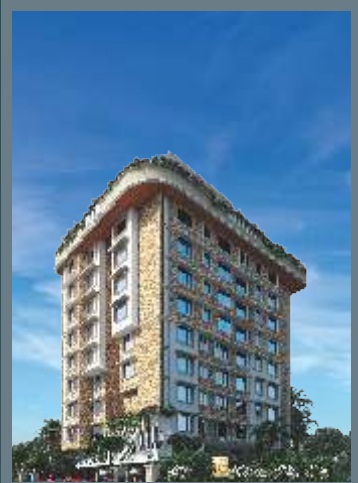
ATHARVA — CHEMBUR —