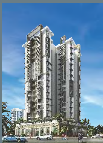
PRARAMBH — CHEMBUR —