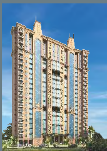
HERSH AANGAN — CHEMBUR —