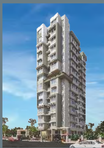
SHOBHA AAYU — CHEMBUR —