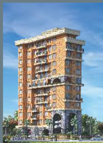
AUMKAAR — CHEMBUR —