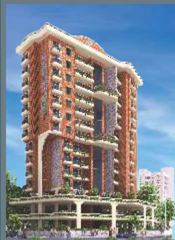
RUDRAKSH — CHEMBUR —