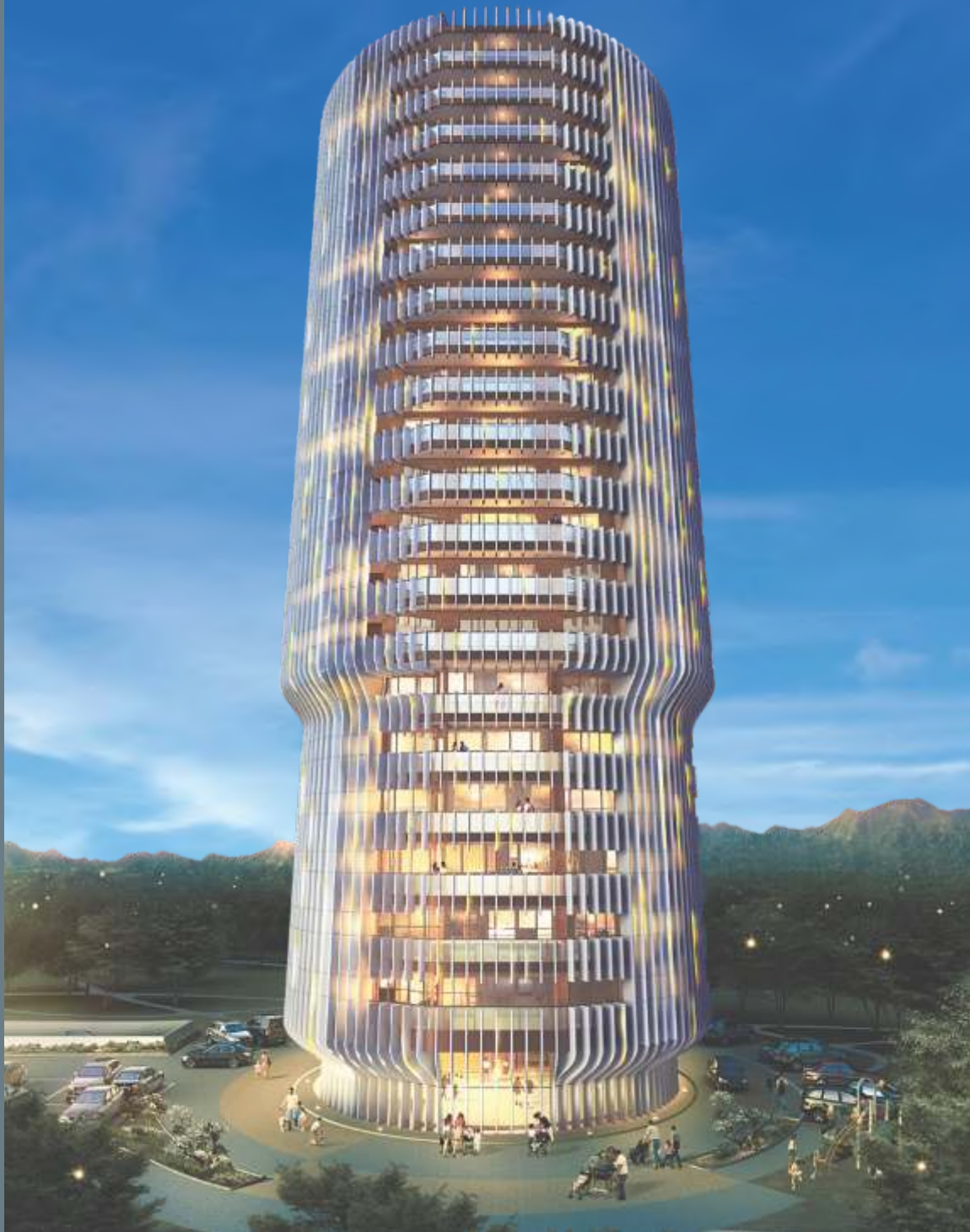
ARANYA - CHEMBUR