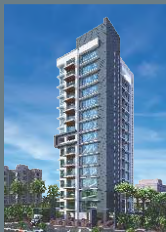
THE GRAND — CHEMBUR —