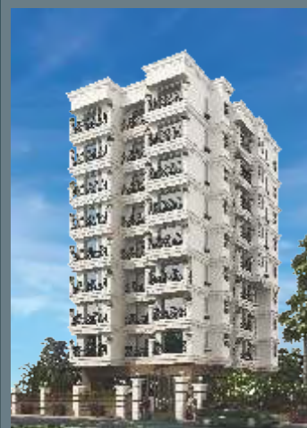
SRINIVAS — CHEMBUR —