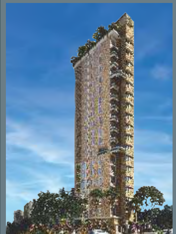
AAROHA — MATUNGA —