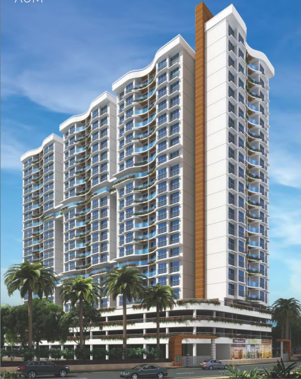
AUM - CHEMBUR