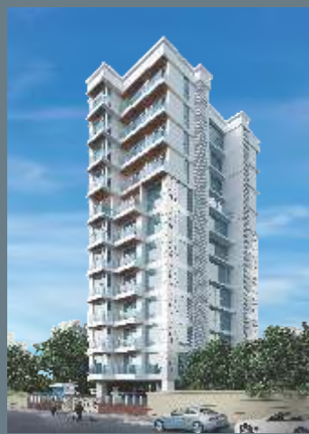
SAMRUDDHI — CHEMBUR —